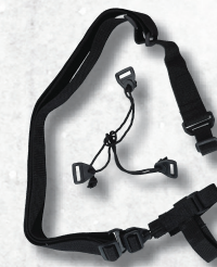
FN UNIVERSAL TACTICAL SLING